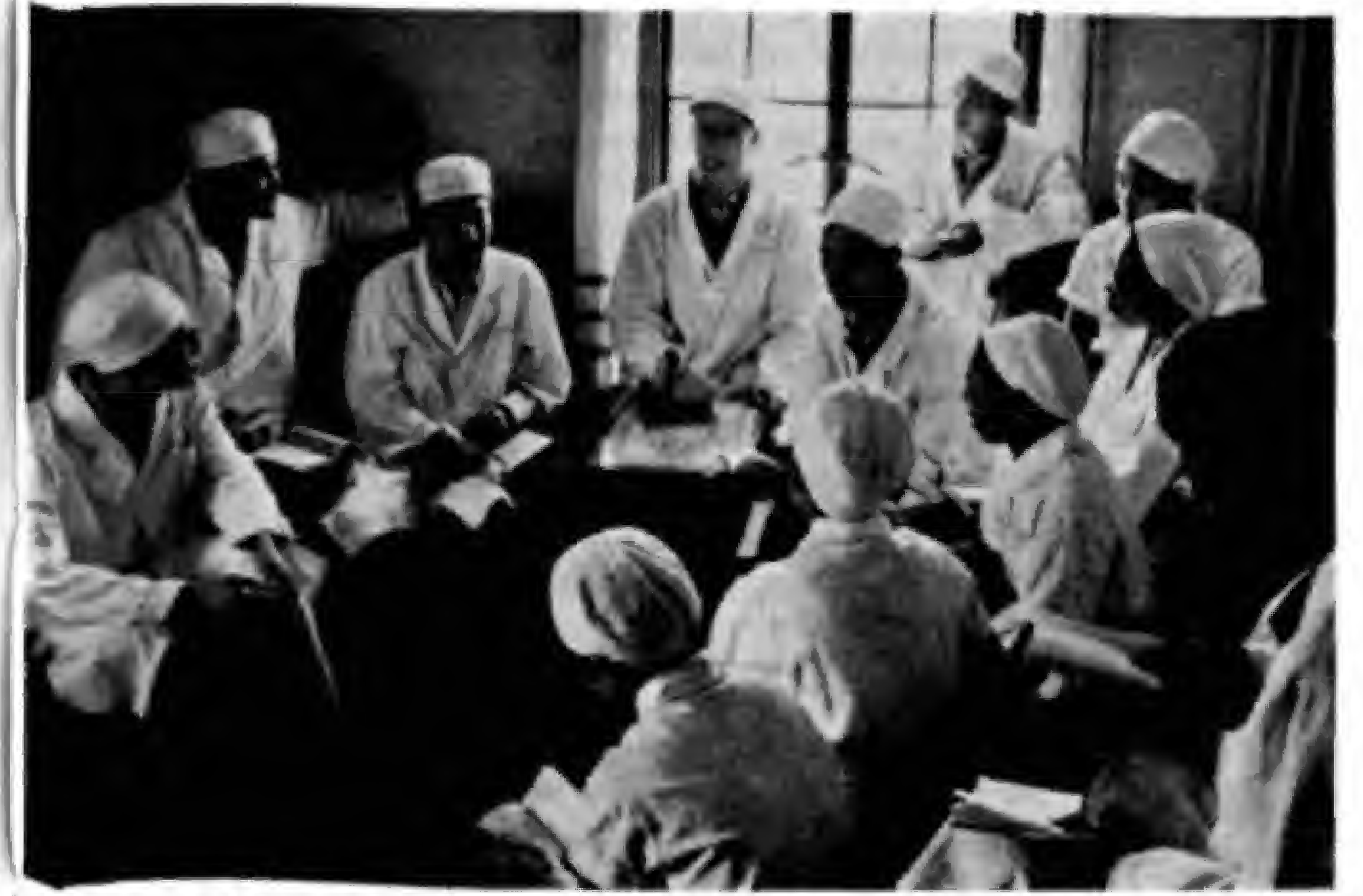
A group of the surgical staff of the Shanghai No. 6 People's Hospital study Chairman Mao's works.

Rejoining a severed finger is of course much harder than rejoining a severed hand. According to foreign medical journals, even the larger blood vessels of the fingers -usually less than 1 mm. in diameter and thus finer than a pin